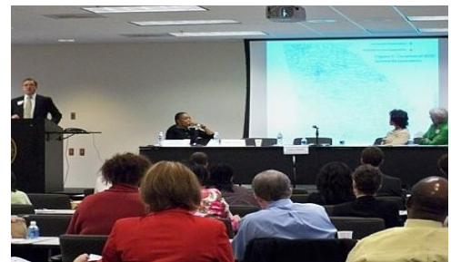
The audience hears the findings of the 2007/2008 Georgia Legal Needs Study