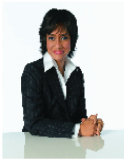
Judge Glenda Hatchett